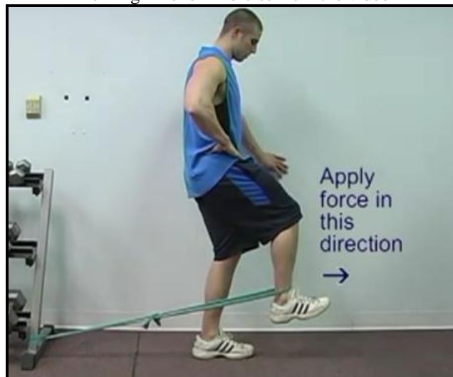
The Thigh Flexor Exercise from the video

Note: You will be exercising your right and left thigh flexor muscles with three sets every other day. That's it. No more, no less.